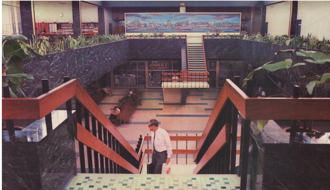
Interior view of Passenger Terminal building. The mosaic mural in the background, titled "Skyline of Singapore" by William P. Mundy, is one of the winning entries in a design competition held for the airport in 1963