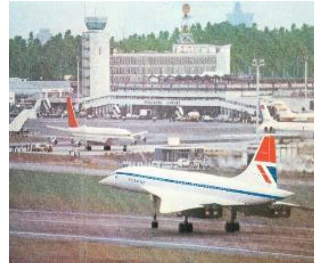
Paya Lebar Airport with concorde in the foreground, 1970s.