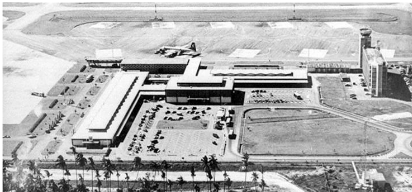
Aerial view of former airport buildings in 1950