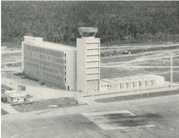
Control Tower Building, 1961.