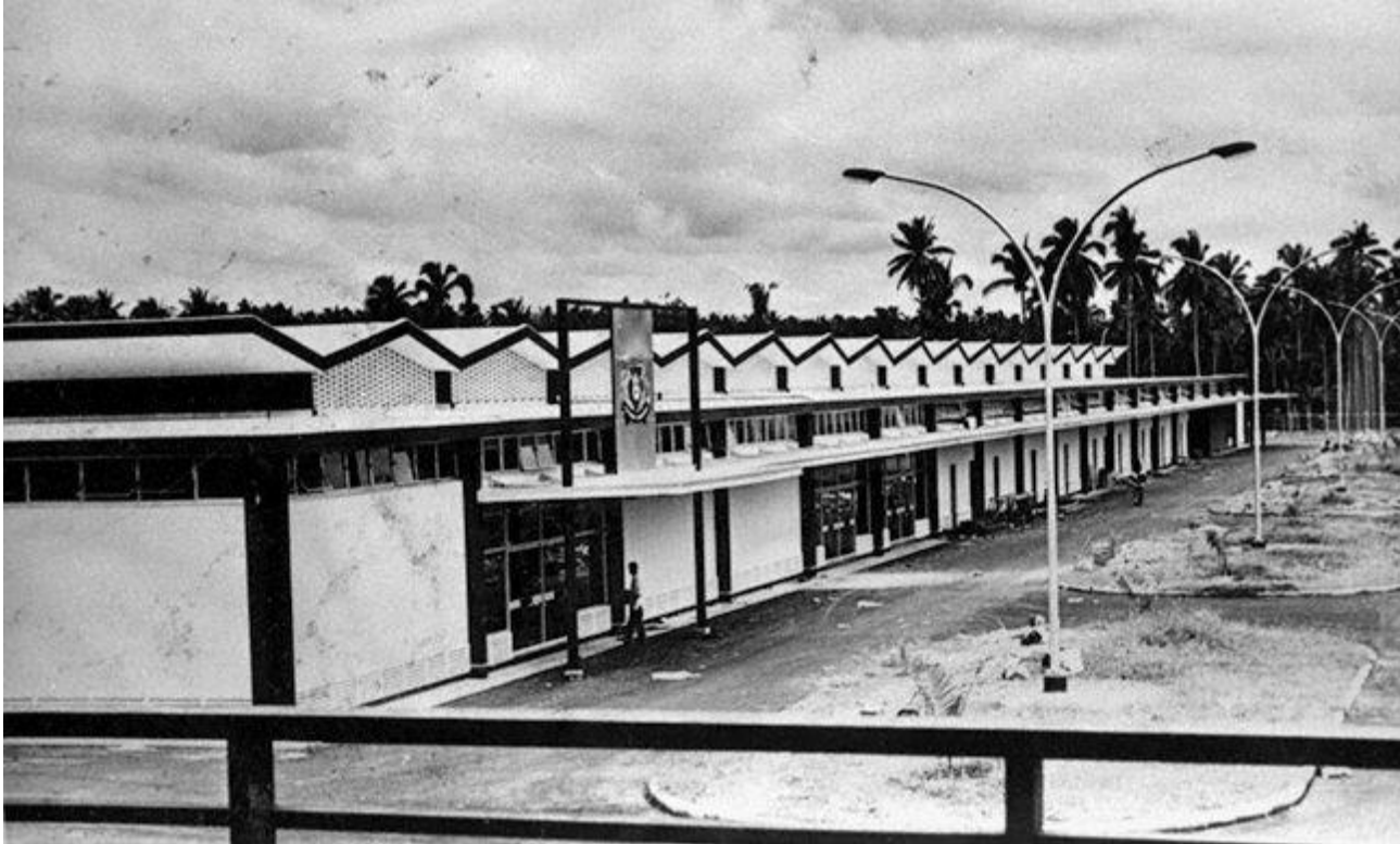
Paya Lebar Airport in 1964.