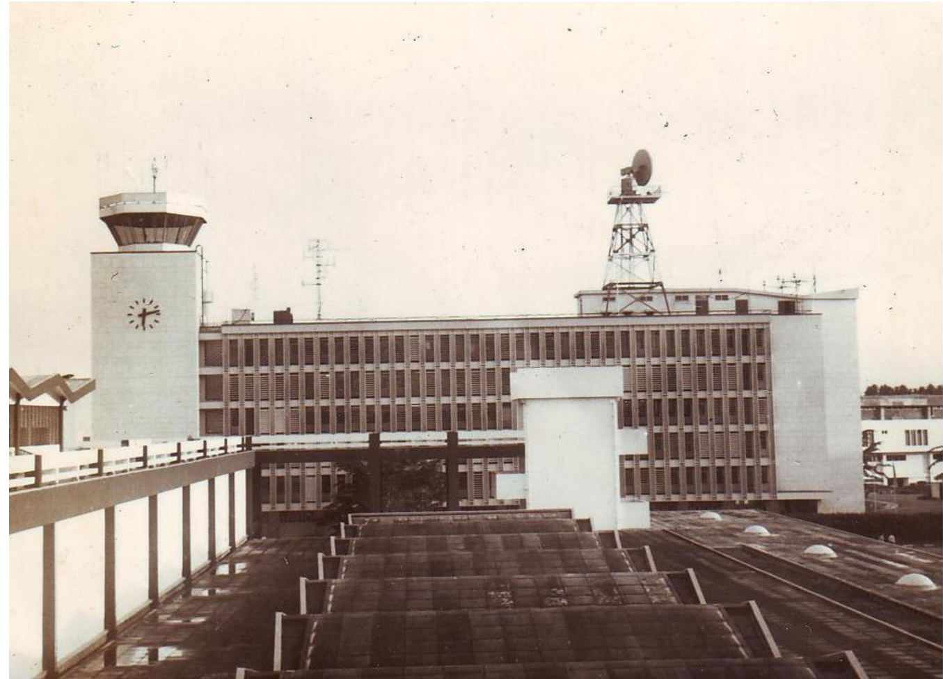
Control Tower Building, 1971.

Digital copy © National Library Board Singapore 2008. Original work © Chung Shui Ken