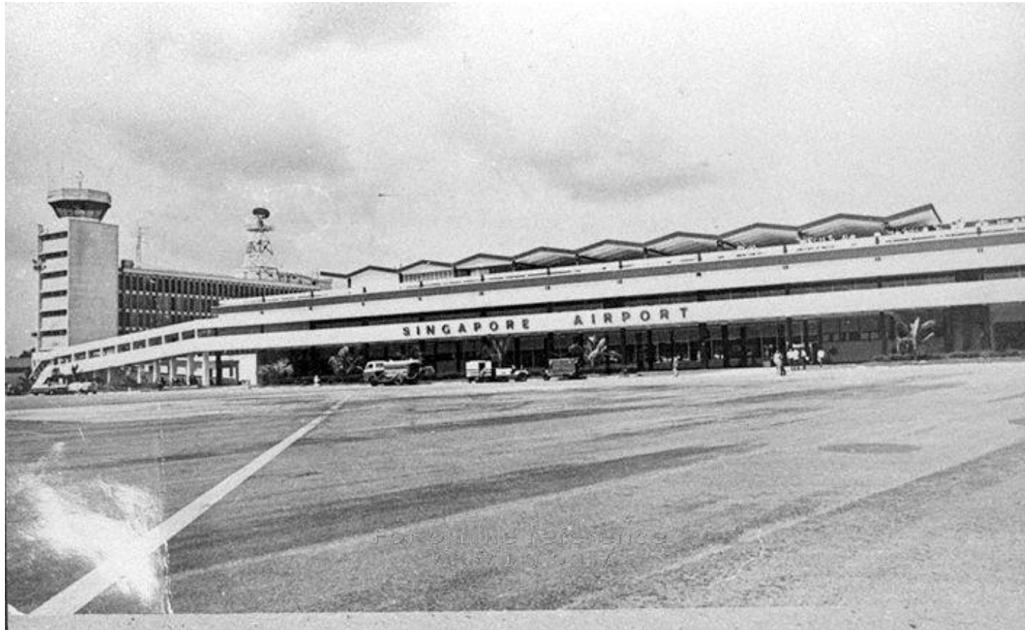
Paya Lebar Airport, 1964.