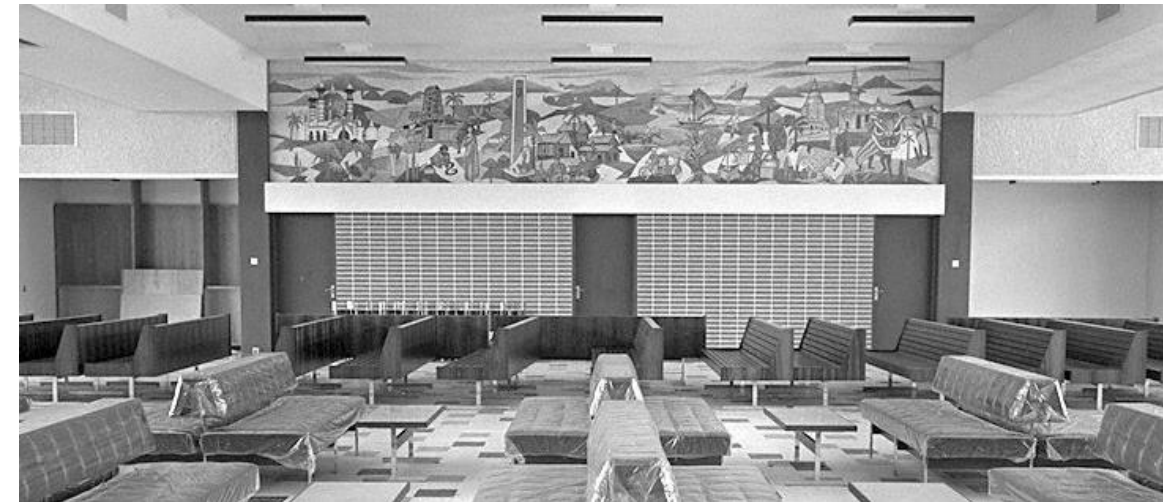
Interior view of Transit Lounge 1964.