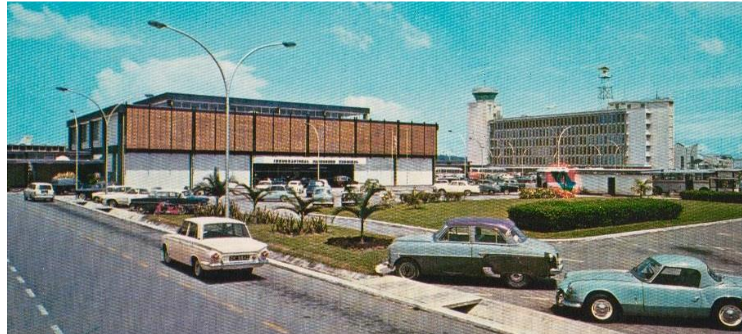
The airport in the 1960s-80s.