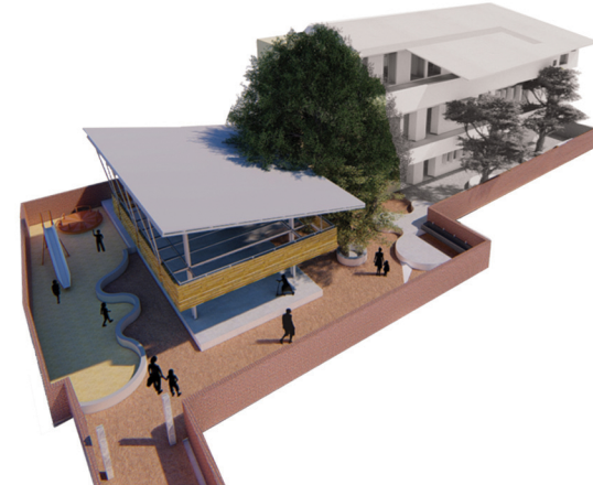
Site intervention and existing condition