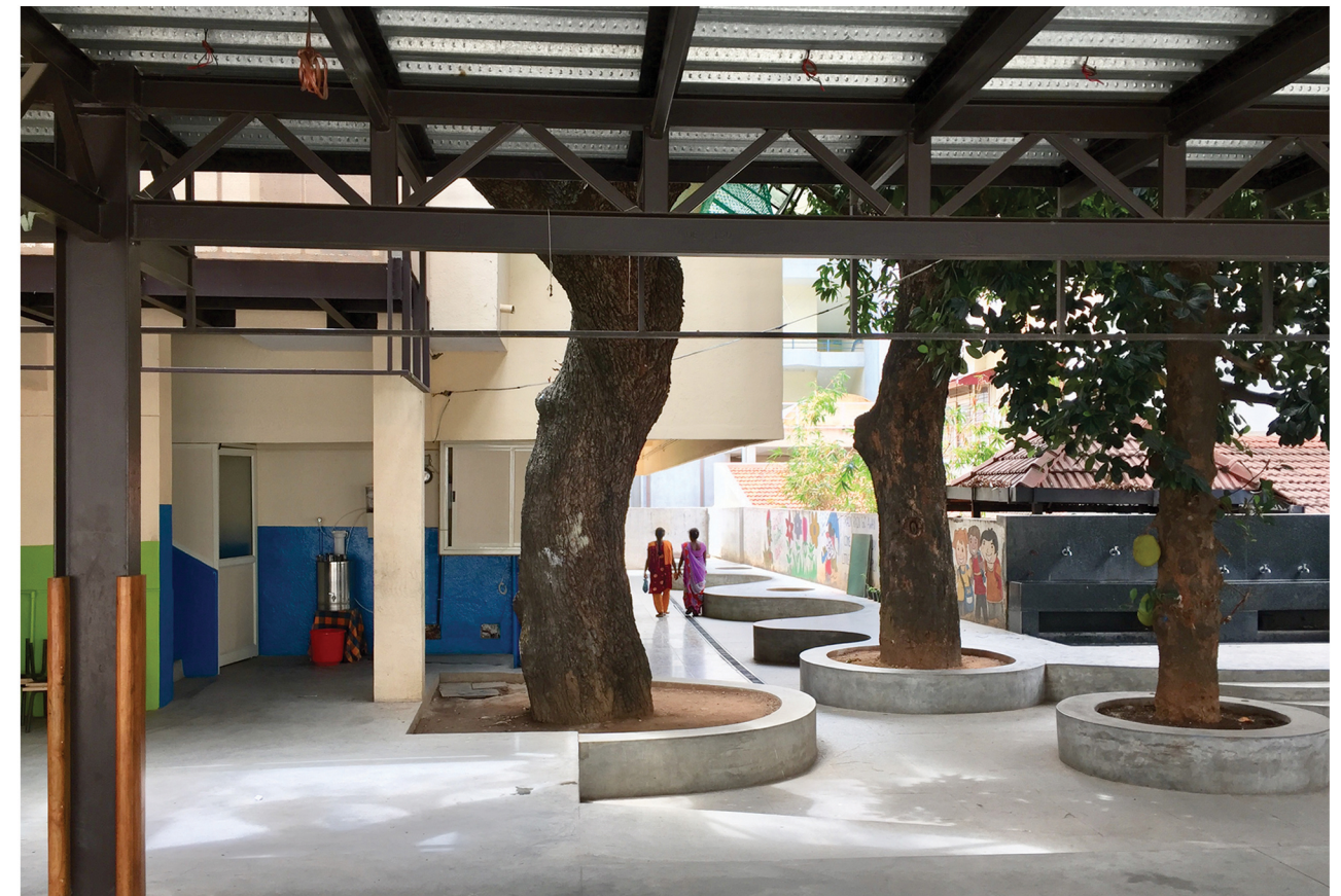
Views of intervention